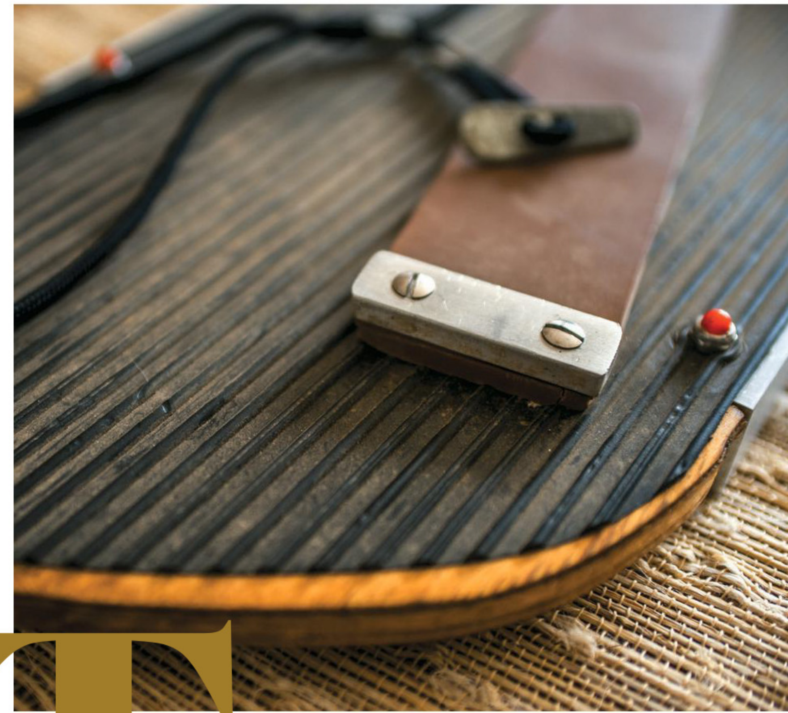
Specific red cap nuts and flathead screws can be difficult to find.

T he private messages poured in, lowballing, warning against lowballs, congratulating on the find, desperately pleading to make a deal off of eBay (one French-Canadian guy even offered to pay 7,500 dollars in monthly installments), and naturally included some very specific questions about the board's features—whether the inserts were brass or galvanized and if the lettering was raised or screen-printed.